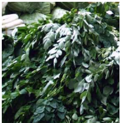
Moringa leaves for sale at the market