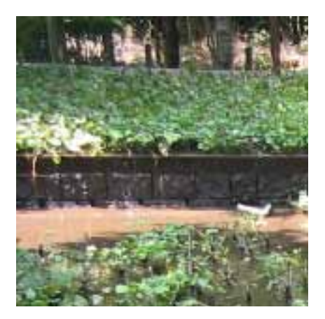
Wasabi cultivated in a widened stream bed