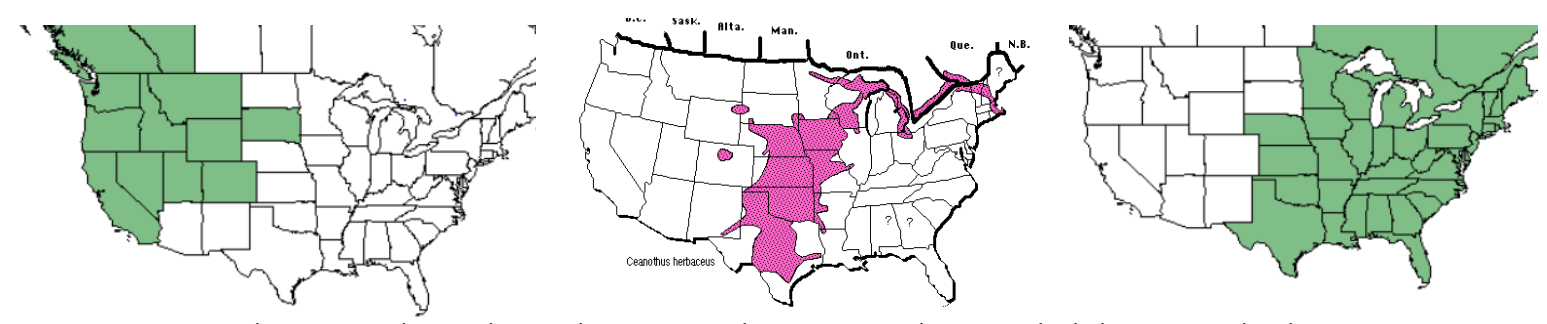
The 3 most widespread Ceanothus species in the US. Reported in states shaded in green and pink; Left- C. velutinus, Center-C. herbaceus, Rght- C. americanus