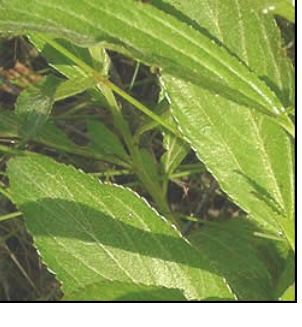
shrub commonly known as C. velutinus, Snowbrush. Jersey tea or Redroot. It too

C. velutinus, Snowbrush or Redroot, is native to generally higher elevations in western states. The photo below was taken at Seven Oaks Nursery in OR. This one is evergreen with glossy, thicker leaves that are fragrant when crushed. It grows to as much as 8' in suitable conditions. Its native habitat is open, sunny, rocky hillsides and partially shaded forests on moderately dry to moderately moist slopes and on steep canyon slopes.