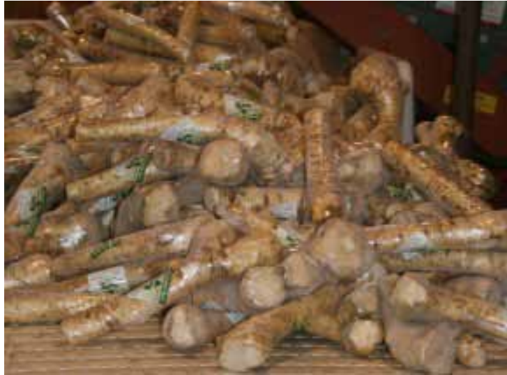
Horseradish roots cleaned and wrapped

Karen O'Brien , continued from previous page