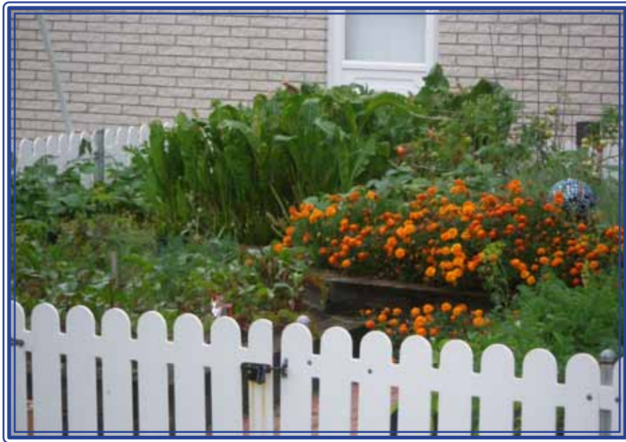
Horseradish in Sue's garden

So I'm the horseradish lady and my signature herb is Armoracia rusticana . Horseradish is susceptible to rust; is that why the " rusticana "? For 2011 I will have to try some of the many recipes I have for ways to use horseradish; some sound good, some interesting and some YUK! For the really brave you can grate it raw, dip it into a little lemon juice or white vinegar to prevent it from turning dark and sprinkle the flakes over your salad or whatever you have. However you decide to use it, you can always depend on it clearing your sinuses, and that is a good thing when you live in the Great Lakes region. I have always liked horseradish but never expected it to be this much a part of my life.