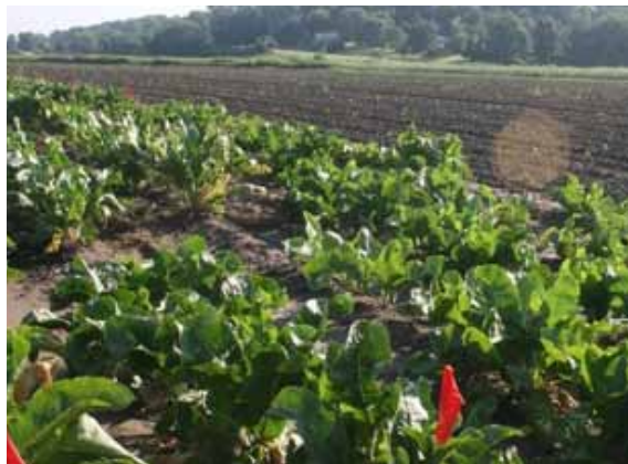
Trial Field at Keller Farms

We were treated to a tour of horseradish growing on the flat, fertile plains of southwestern Illinois. The growers are very protective of their crops, and do not divulge the varieties that they grow. The Keller Farm has a section of one of their fields dedicated to horseradish trials. In commercial production, the root is treated as an annual, even though horseradish is a perennial. The roots are harvested, and the small pieces are trimmed and used as set roots to plant for the following year. Most of the root expansion takes place in the fall, and the harvest is usually done in November.