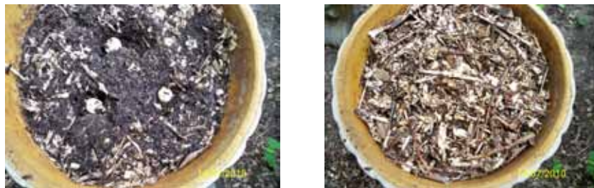
Photos: L: Newly planted roots, R: Mulch covering

When I mentioned to another North Texas Unit member that I was attempting this, she decided to try it too. I'm not sure of the procedure that she used, but her roots produced shoots several weeks before mine. She mentioned that the roots begin to swell just before sprouting, so I dug down to check and promptly knocked off the one sprout that I found. I thought it was done for, but the next week, I had multiple sprouts coming up.