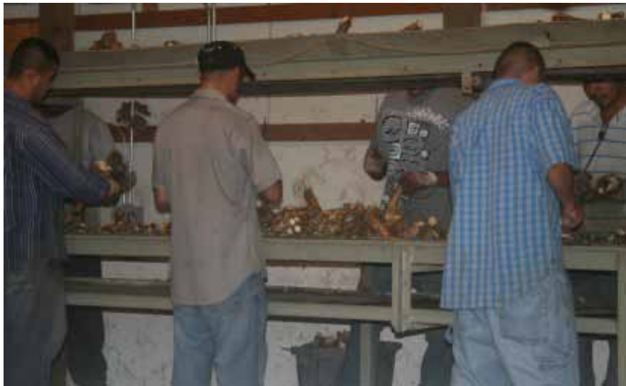
Culling and cutting the horseradish roots into uniform pieces

We then traveled to Kelly Farms, where the processing of horseradish takes place. There were huge pallets of the harvested root, mounds of washed and peeled roots, and all kinds of equipment necessary to provide clean and uniform packaging of these pungent roots. It was surprising that the odor in the processing area was not stronger, but since there was no crushing of the root in the presence of water (as when the roots are ground in the making of the horseradish sauce you find in grocery stores) the aroma was very mild.