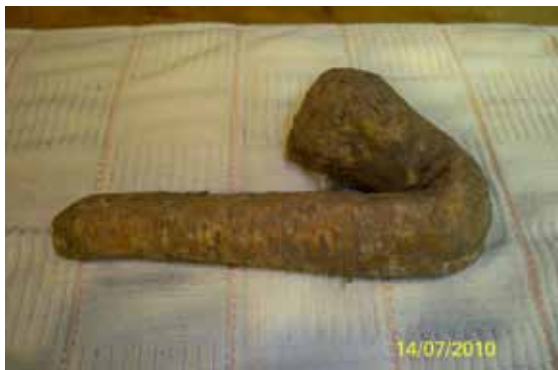
Cutting up the root

At the grocery store, I chose a firm horseradish root. I cut it into 2" pieces. I cut the bottom of the root at a 45-degree angle and cut straight across on the top of the root so that I wouldn't mix up which end went up. I placed these pieces vertically in the pot, angled part down, about three inches apart, in a pot filled with commercial potting soil. I then covered the entire surface with 1" of commercial potting soil and 1" of mulch. I placed the pot in a semi-shady (morning sun and afternoon shade) location and watered the pot with root stimulator. I kept the potting medium moist but not wet.