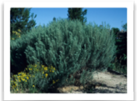
www,wildflower.org Image by: Sally and Andy Wasowski

Wild tarragon is a coarse erect deciduous perennial weed. It grows to 5 feet tall and spreads by rhizomes that make the plant difficult to control.