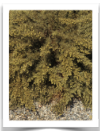
www,wildflower.org