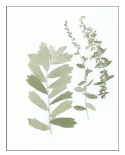
Artemisia Iudoviciana 'Silver Queen'