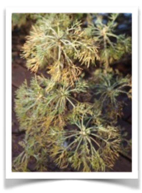
Artemisia abrotanum