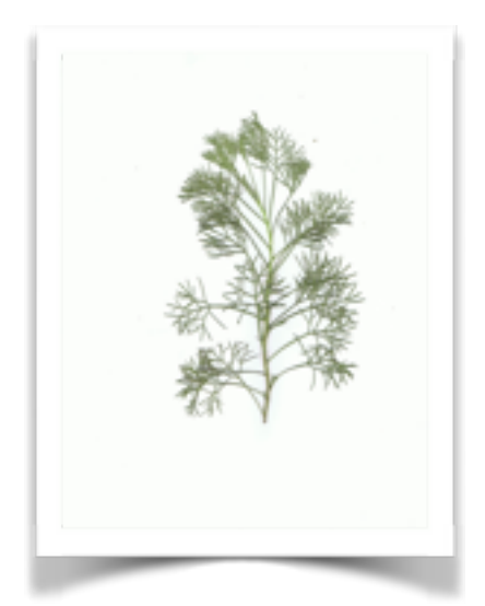
Artemisia abrotanum

What follows is a sampling of these useful plants: