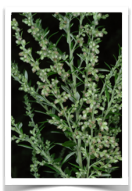
Doug Goldman @ USDA-NRCS PLANTS Database / USDA-NRCS-NPDT

Artemisia vulgaris (mugwort, moxa herb, felon herb, St. John's plant, Cingulum Sancti Johannis, chrysanthemum weed, wild wormwood, Old Uncle Henry, sailor's tobacco, naughty man or old man). Native to Europe, Asia, Alaska and northern Africa, mugwort has become naturalized in North America in Zones 4-8, where many feel that it is an invasive weed. It grows 3 to 5 feet tall and 1.5 to 2.5 feet wide. The pinnate, toothed leaves are dark green on the top with white tomentose hairs on the bottom. They are strongly aromatic, pungent and resemble chrysanthemum leaves. The upright stem has a slight purplish cast and the small inconspicuous reddish brown hermaphrodite flowers are carried at the top of the plant in clusters. Some references state that viable seed is rarely produced in the United