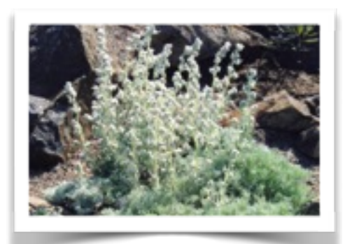
A. caucasica (A. alpina)