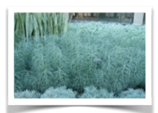
Artemisia parviflora (A. japonica)

Richters (2014) lists A. hololeuca as a medicinal herb, and, indeed, the chemical composition of Artemisia oils has been investigated in many species (including A. hololeuca ) for chemotaxonomic reasons and in a continuous search for new active and/or flavoring molecules (Wright, p. 13).