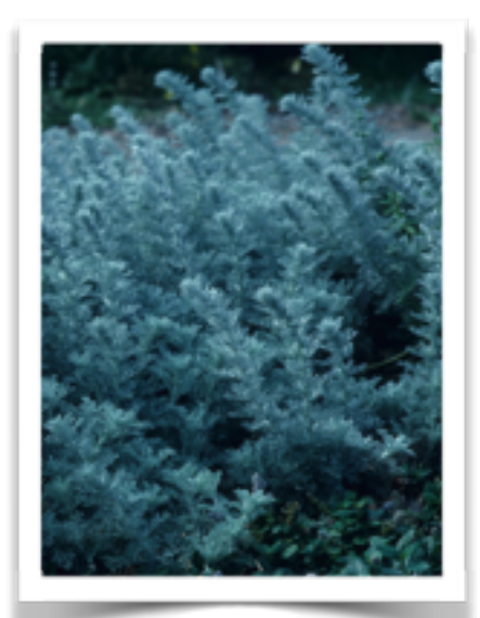
http://www.wildflower.org/ image_archive/640x480/SAW/ SAW 00352.JPG

Japan (see A. vulgaris , p 42.) to treat eczema, itchy skin and excessive womb bleeding in China (Richters, 2014), and traditionally as an emetic and to treat diarrhea (Dr. Duke's database). It is also used in industry to dye cotton and silk (Richters, 2014). The plant is perennial in Zones 5-9 and can reach 3 feet in height.