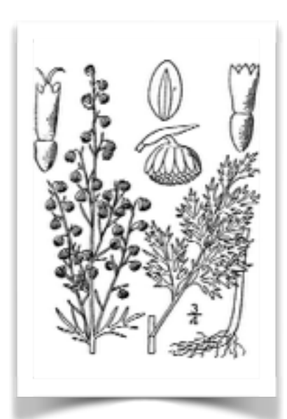
USDA-NRCS PLANTS Database / Britton, N.L., and A. Brown. 1913. An illustrated flora of the northern United States, Canada and the British Possessions. 3 vols. Charles Scribner's Sons, New York. Vol. 3: 527.

Artemisia pauciflora (Russian santonica, Levant wormseed, Tartarian southernwood) is a medicinal herb from the steppes of central Asia where unexpanded flower buds or heads are used to treat worms (anthelmintic), to encourage menstrual flow (emmenagogue), and as a stimulant. The plant is small (to 12 inches tall), perennial, grey-green, aromatic and bitter. Crusaders returning from the Middle East introduced it to Europe where it was also used to treat worms (Richters, 2014). Hardy in Zones 3-8.