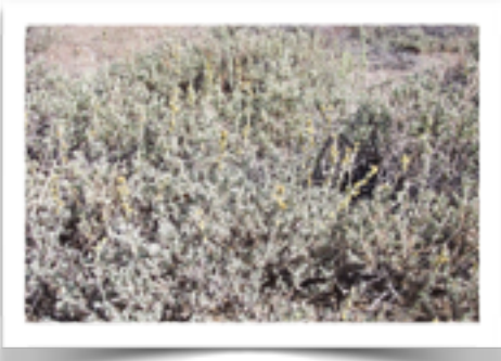
USDA-NRCS PLANTS Database

responsible for its effectiveness in treating inflamed skin conditions." Preparations of tree wormwood are also used to treat respiratory problems. They are best avoided in pregnancy and by babies and children even though they have a low thujone content.