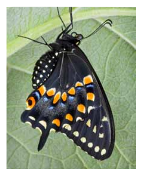
Black Swallowtail on Leaf

(from a lecture Susan gave on August 5, 2009)