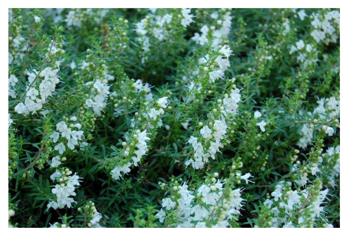
Winter Savory - Satureja montana in bloom