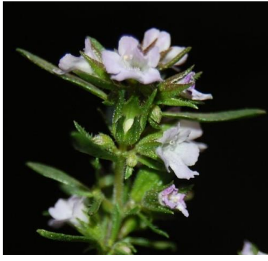
Summer Savory