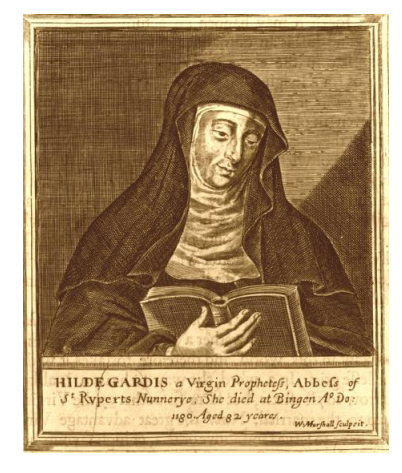
Hildegard of Bingen Engraving by W. Marshall from Fuller's Holy State , published 1648.