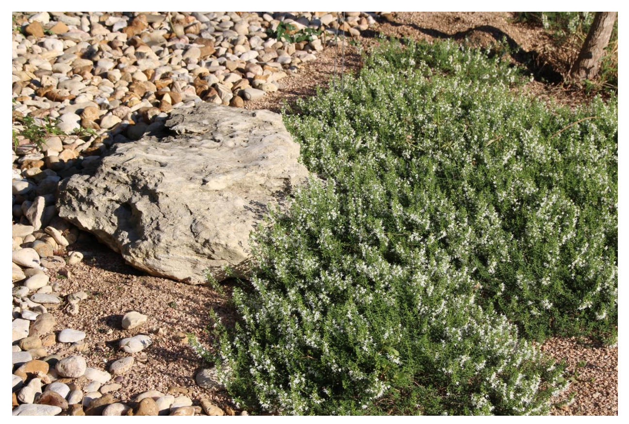
Creeping Savory