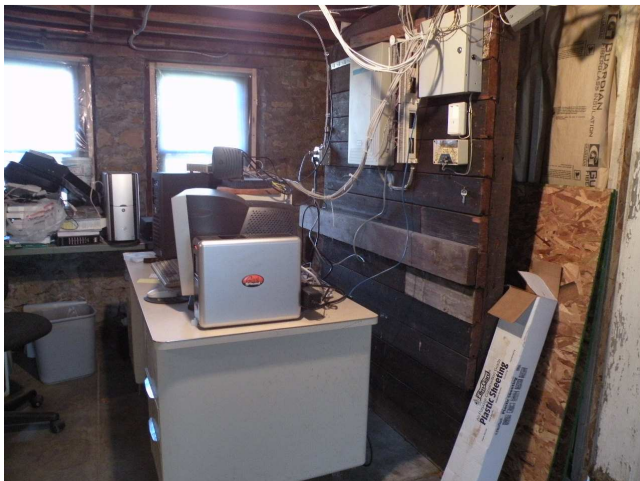
Electrical panels prepared to be relocated