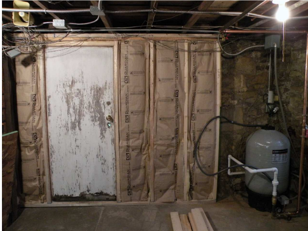
Temporary interior wall-will be the exterior wall of the southern end of the building while the new addition is being built.