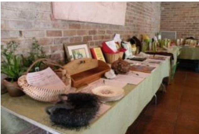
Silent Auction, raffle, ways & means tables